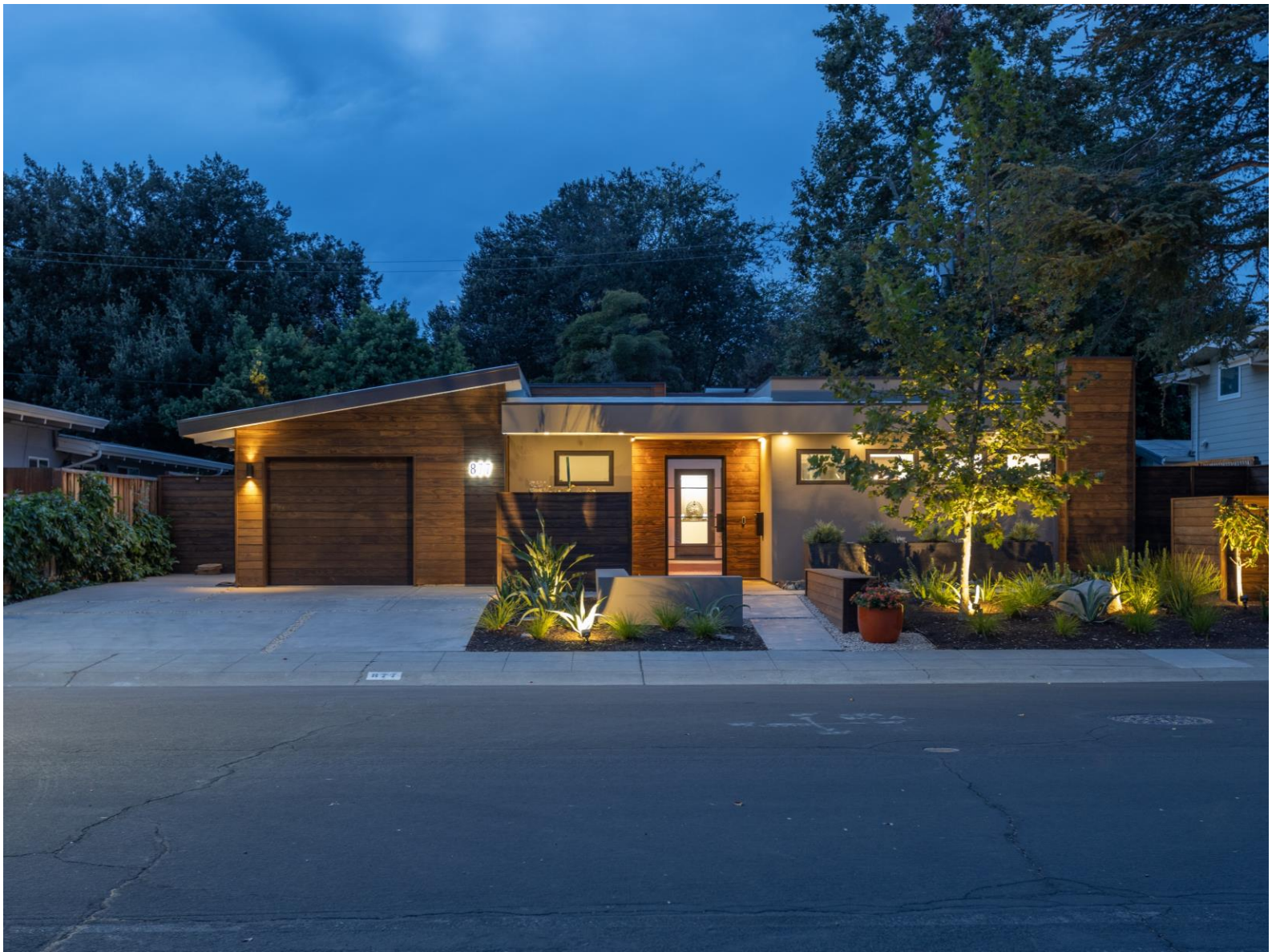
AFTER: This home has made a stunning transformation. The dated exterior now has modern design with many architectural details.