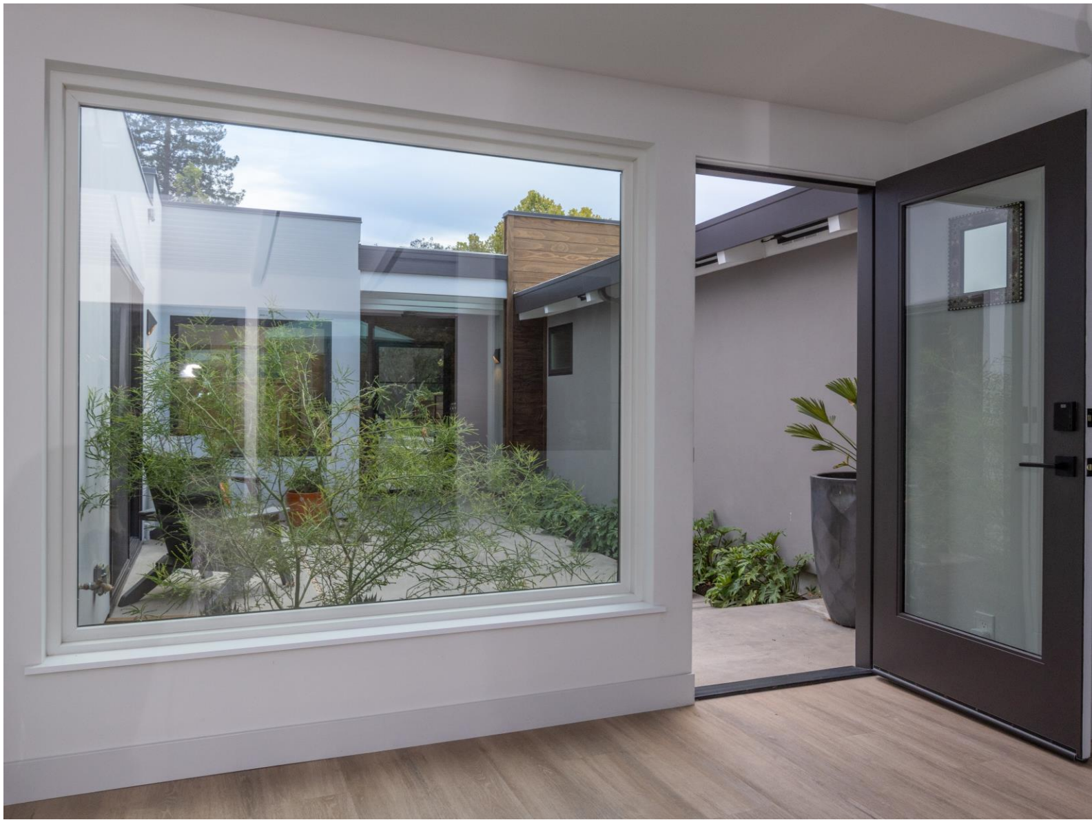
AFTER: Here's the view from just inside the entry door looking out into entry courtyard.