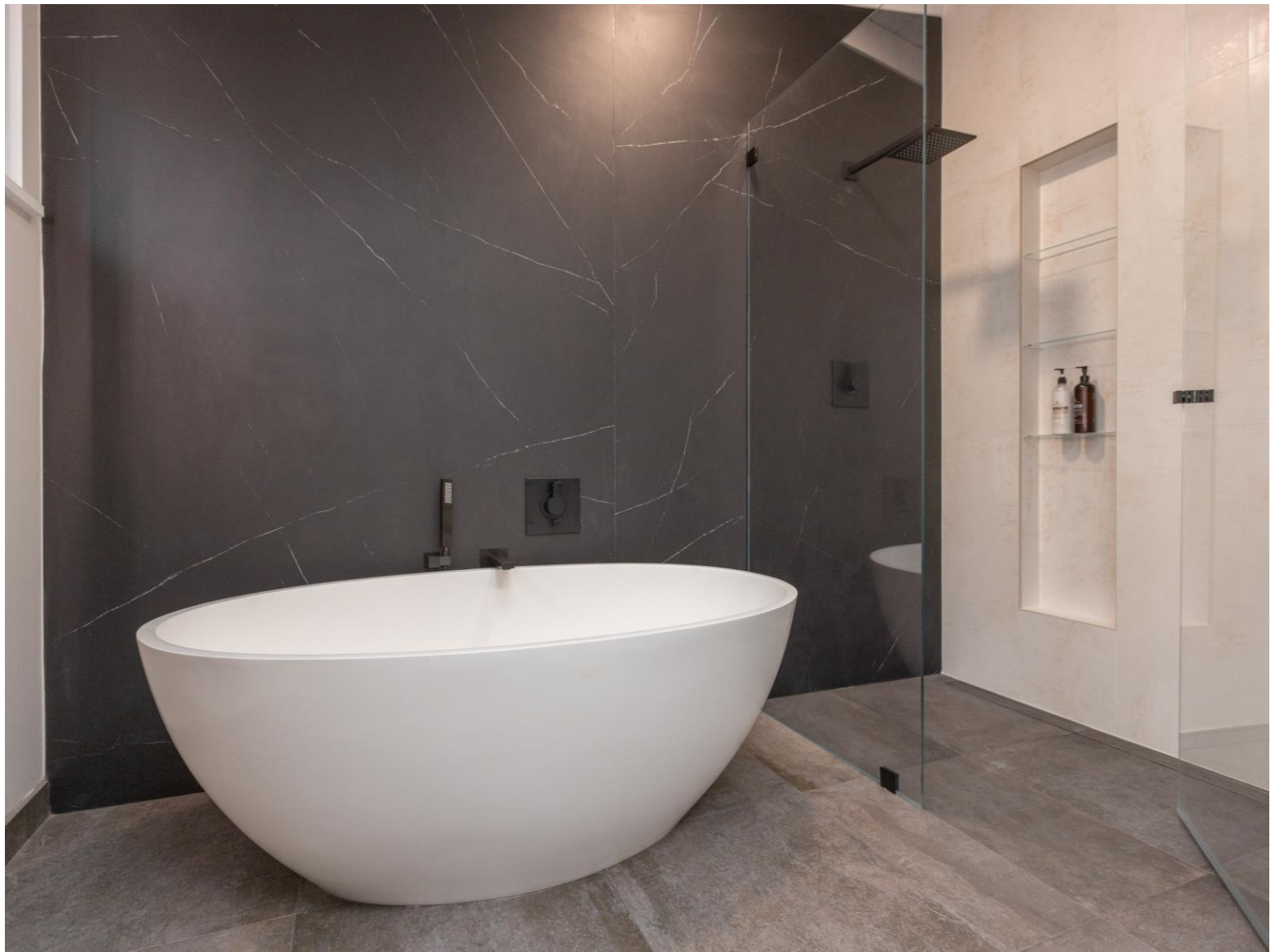
AFTER: Serene soaking tub against a dramatic porcelain slab. The large curb less shower blends seamlessly against the white tiled wall, with a generous niche to hold shower items.