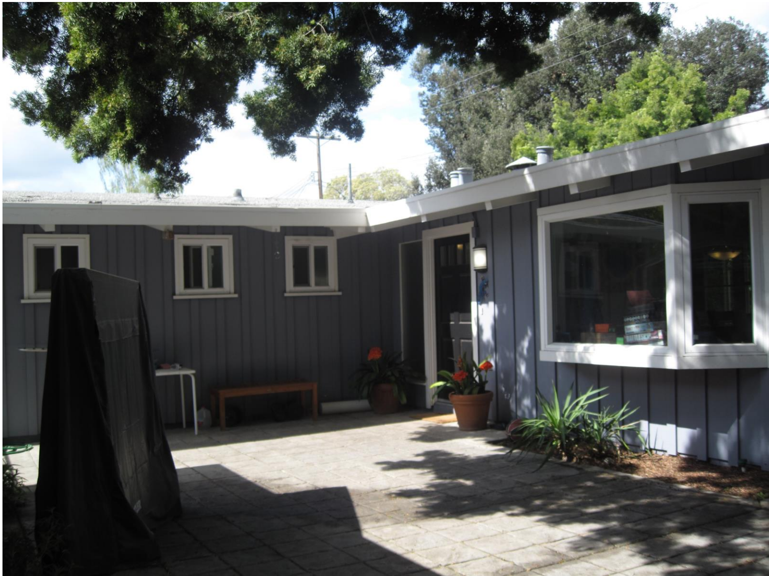
BEFORE: Entry courtyard with paver patio.