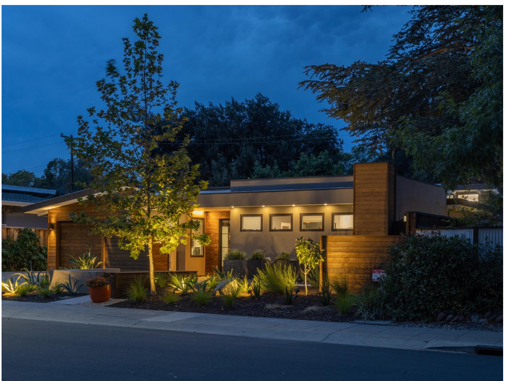
AFTER: The materials, textures and colors chosen help the home blend with the landscape and surrounding neighborhood.