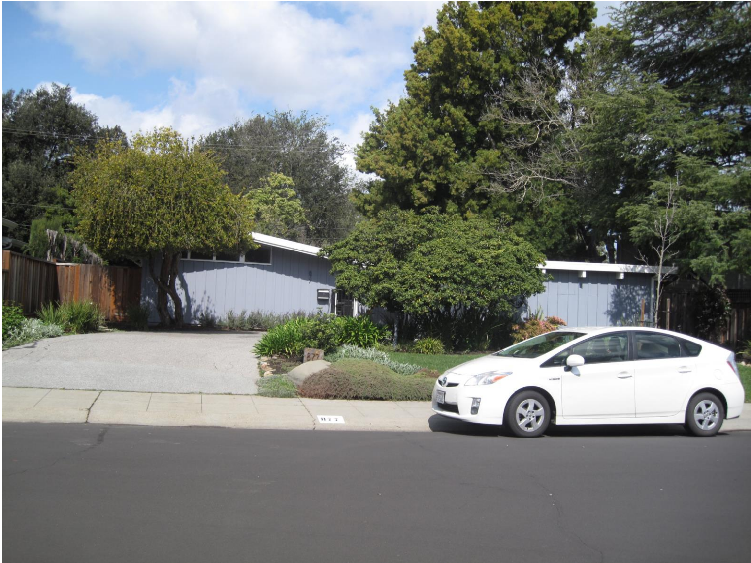
BEFORE: This aging mid-century home lacked curb appeal.