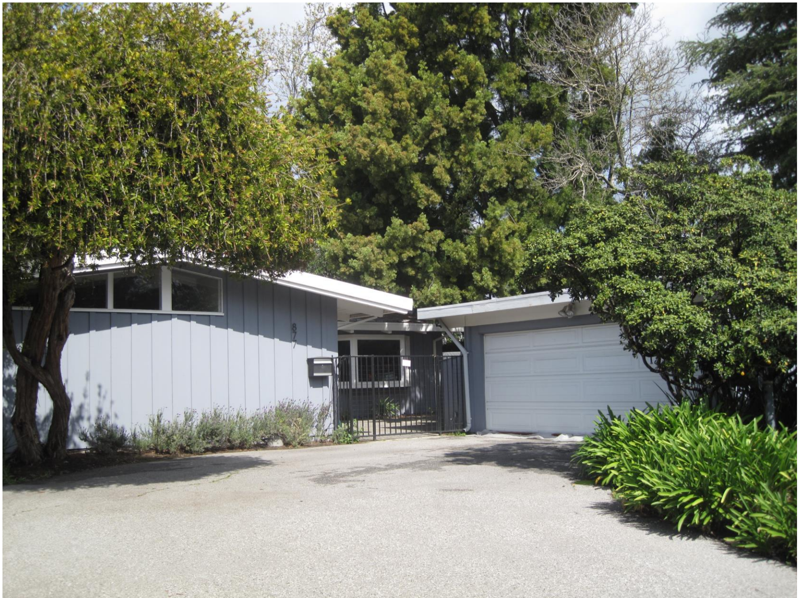
BEFORE: On the right side you see the detached garage